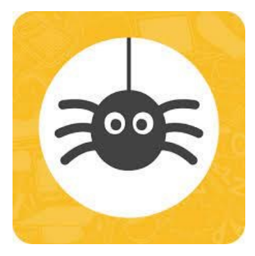
School Spider Log Ins

Next week will be the last week for the clubs above. We will have some new afterschool clubs after our half term holiday. Letters will be available next week to sign your children up.